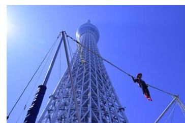
Jump Zone (Last year)

Age: Mainly for preschoolers and elementary school students