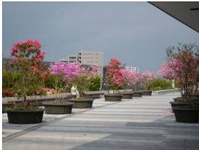
Mitsubatsutsuji azalea From mid-March Tsutsuji-haruichiban rhododendron From mid-April Shakunage rhododendron From early-May (West Yard, 4th Floor)