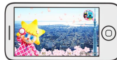
Photo image at observation deck

At the TOKYO SKYTREE® observation deck, launching the dedicated photo app and passing your smartphone over the "Sakidori" symbol will display cherry blossoms in full bloom, along with Sorakara-chan and other official characters, on your smartphone. You can take photos with these characters against the background of the view from the observation deck and even share the photos on social media.