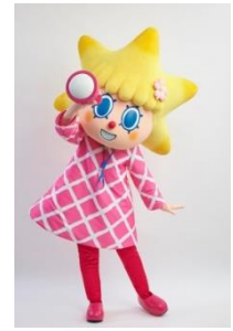
Sorakara-chan in a spring limited cherry-colored costume (image)

*The time or place may be changed or events may be cancelled without prior notice due to bad weather.