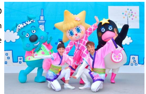
Sorakara-chan's Sakura☆Dance! (image)

Place: TOKYO SKYTREE TOWN® Sky Arena (4th floor) Special Stage