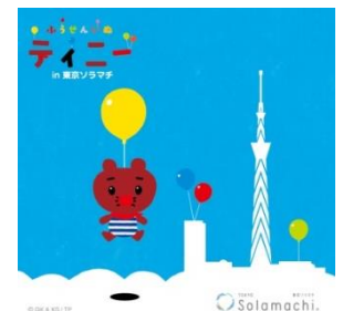
Tinny & the Balloon in Solamachi! (Image)

Place: TOKYO SKYTREE TOWN ® Sky Arena (4th floor)