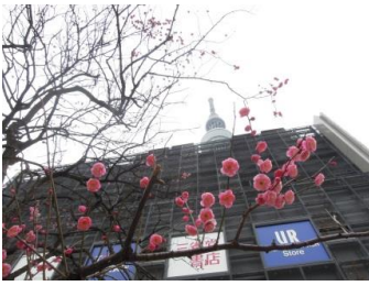
Japanese apricot From mid-February (Hanami-zaka Square)