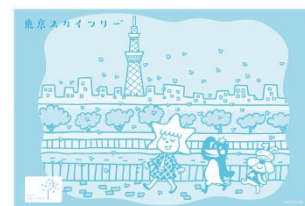
Original picnic sheet (Image)

In this stamp rally event, you can get an original picnic sheet by going around to four or more sightseeing places and cherry blossom viewing spots around TOKYO SKYTREE and collecting stamps. Launching the dedicated photo app at designated spots around TOKYO SKYTREE and passing your smartphone over a dedicated device will display cherry blossoms in full bloom along with Sorakara-chan and other official characters on your smartphone.