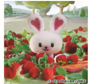
Mofy's Fuwafuwa World (Image)

Mofy's Fuwafuwa World will display cotton-made characters, etc. that were actually used to create the world's first stop-motion animation using cotton materials, and you can experience the Mofy's unique worldview. The event "Tinny & the Balloon in Solamachi!" on the other hand, will allow you to feel and enjoy the "somewhat strange" Tinny's world. During the period of the two events, visitors will also have an opportunity to get greetings from Mofy and Tinny.