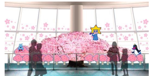
Tembo Deck decoration (image)

Place: TOKYO SKYTREE 1st Floor, 4th Floor, Tembo Deck, and Tembo Galleria