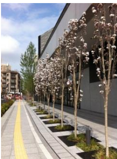
Amanogawa cherry blossom From mid-April (West Yard, 1st Floor)