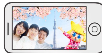
Photo image in stamp rally

TOKYO SKYTREE (5th floor and Tembo Deck), Oshinari-kun no Ie (House of Oshinari-kun), Azu-chan-chi (House of Azu-chan), Azumabashi Tourist Information Center, Asakusa Station Building EKIMISE (7th floor), Ushijima Shrine, and Tokyo Skytree Station (inside the ticket gate)