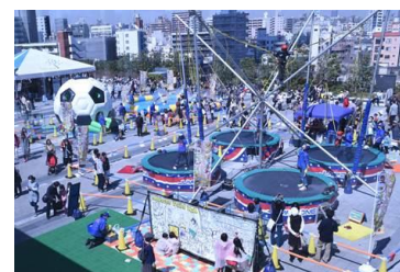
Spring Vacation! Solamachi Wakuwaku Park (Last year)

Spring Vacation! Solamachi Wakuwaku Park 2016 will open, and this amusement park for kids will offer three types of attractions at the foot of TOKYO SKYTREE. Included are the Jump Zone, where kids can jump up to seven meters high; the Bubble Ball, featuring a giant bubble ball with a diameter of 1.5 meters that allows the kid inside the ball to freely move around on the water, and the Caterpillar Fuwafuwa, giant worm-shaped play equipment inflated with air. These attractions are mainly for preschoolers and elementary school students.