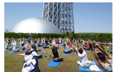
Sola-YOGA in the past

*Please use the elevators at Block 12 on the 1st floor of Tokyo Solamachi.