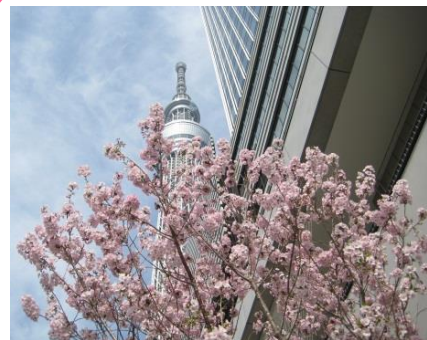
Gotenbazzakura cherry blossom From early April (East Yard, 1st Floor)